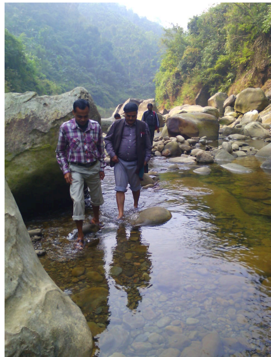
KALAINCHARA , CACHAR DISTRICT ASSAM. ONE HAS TO WALK ATLEAST 3-4 KILOMETERS IN RIVER TO REACH THIS SCHOOL