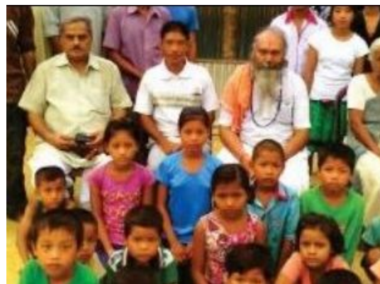
REPUBLIC DAY CELEBRATION AT KARAMSARA RESIDENTIAL SCHOOL