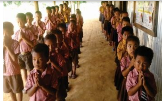
SCHOOL UNDER CONSTRUCTION IN RUYIDRUK (MARFARA), MOMIT DISTRICT & STUDENTS OF CHELAGANG, AMARPUR SCHOOLS